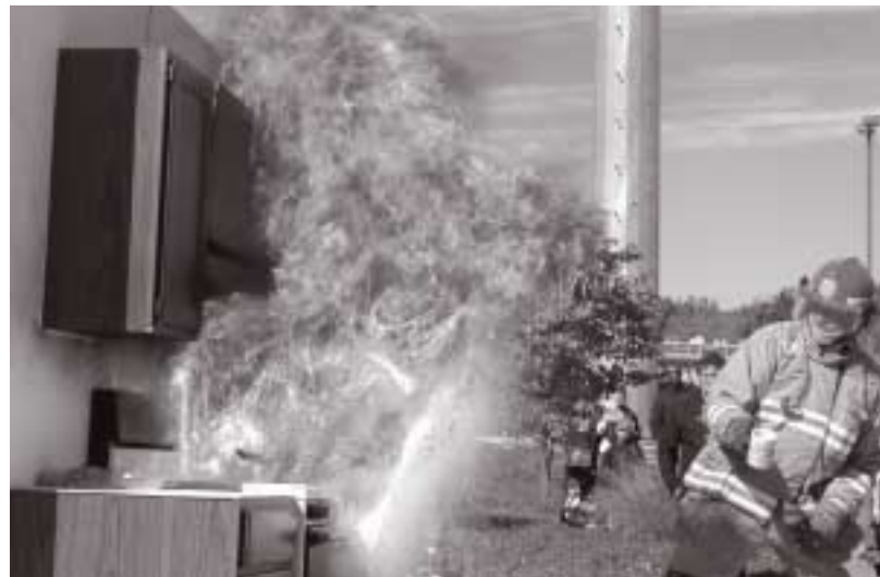
Firefighters demonstrate how quickly a kitchen fire can get out of hand.

Kids can climb on fire engines, squirt water hoses, and even dress up as firefighters. Everyone is also invited to practice a family fire drill in the Community Fire Safety House. You won't want to miss this free, educational, and entertaining event.