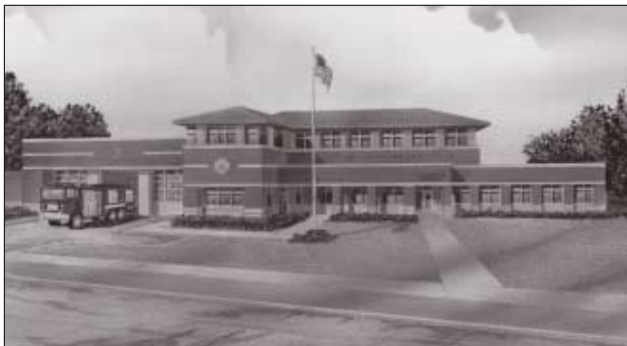
This spring, the City's newest Fire Station and Community Center (located on Grand River one block east of Middlebelt) will be officially dedicated with an Open House and ribbon-cutting ceremony. The new two-story fire station, one of five stations serving Farmington Hills, offers needed additional space for firefighters and their equipment. The Community Center will house after-school youth programs and senior adult, cultural arts, and recreation programs. It will also provide a meeting place for area residents' and homeowners' associations.