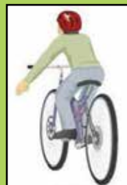
SLOW OR STOP