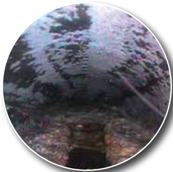
View of FOG build-up inside sewer pipe