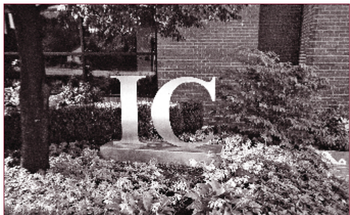
The Beautification Commission presented the 2007 Beautification Commissioners' Award to Illuminating Concepts.

The City of Farmington Hills Beautification Commission presents annual awards to businesses, offices, and subdivision or condominium entrances with attractive and well-maintained landscapes. Judges look for landscape variety, imaginative use of color, and overall property maintenance. Nomination forms are available at www.fhgov.com in May, and judging takes place from June through August. Awards will be presented at the Beautification Commission Awards Ceremony on October 30, 2008.