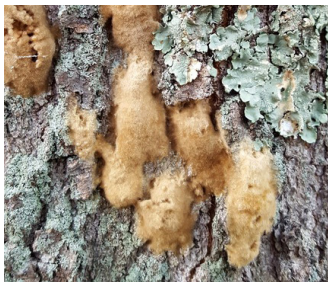
Spongy Moth Eggs