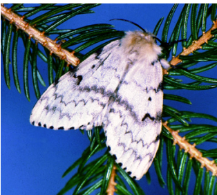
Adult Female Moth

For additional information, go to the Michigan State Extension Service Integrated Pest Management website page at https://www.canr.msu.edu/ipm/invasive_species/gypsy-moth/index .