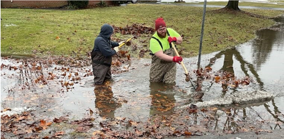
Employees from the City's Division of Public Works unclog a culvert pipe following a recent severe storm.