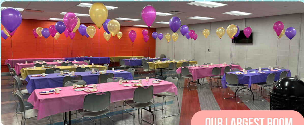
OUR LARGEST ROOM

Celebrate your birthday like never before with our double room! Our spacious room is perfect for a fun-filled party with friends and family. With two rooms attached, you can spread out, play games, and make lasting memories. Room capacity is 45 people.