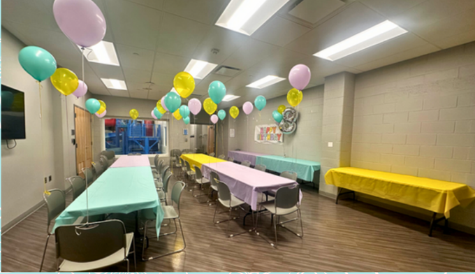
POOL VIEW ROOM