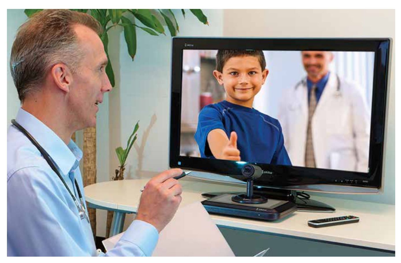
One of the new services enabled by fiber networks is telemedicine, which can improve the health care available in smaller communities.

Consumers who subscribe to FTTH rate it as the fastest, most