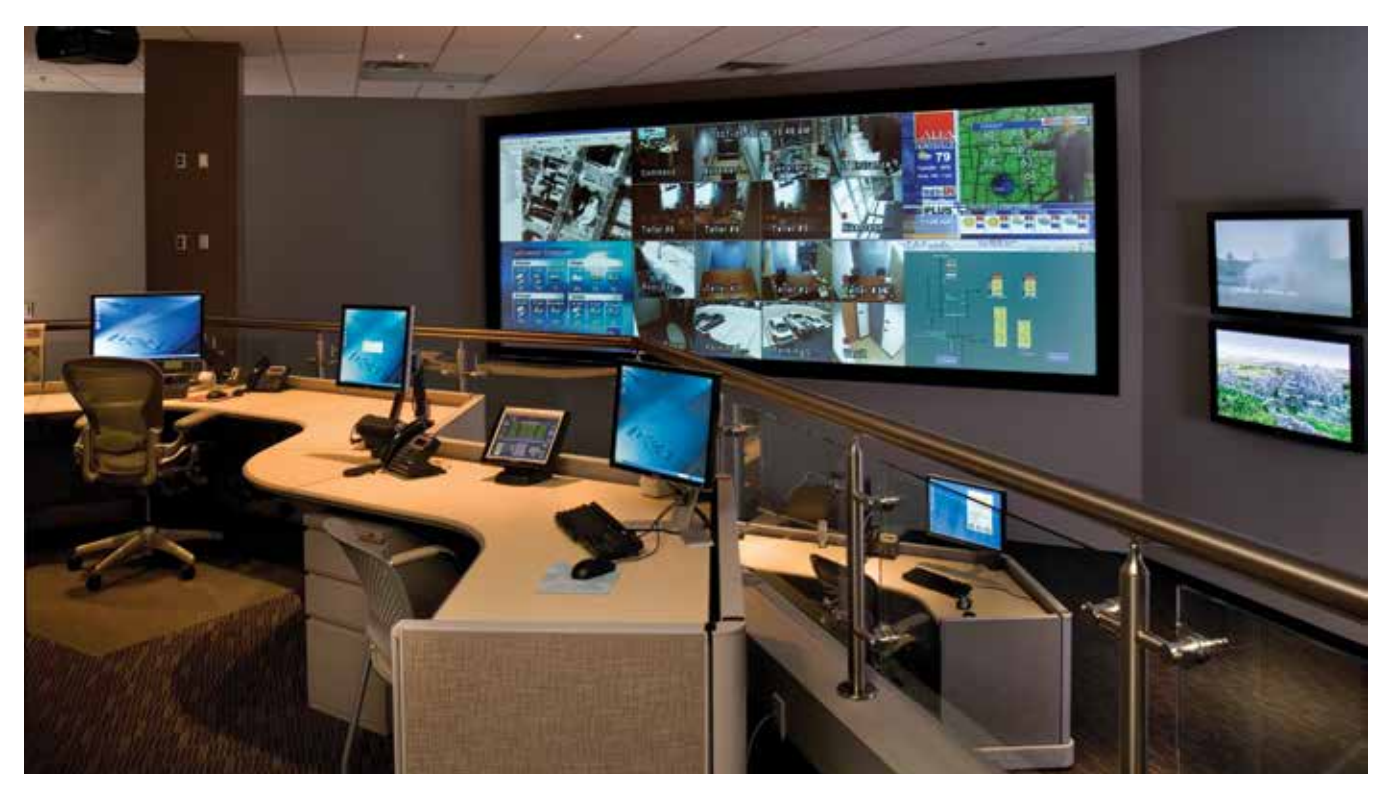
Pulaski Electric System, a municipal electric utility in Pulaski, Tenn., uses its FTTH network to operate a smart electric grid and deliver triple-play services to residents.

when a provider offers them. Start a community fiber campaign online so you can document the extent of subscriber interest in fiber broadband.