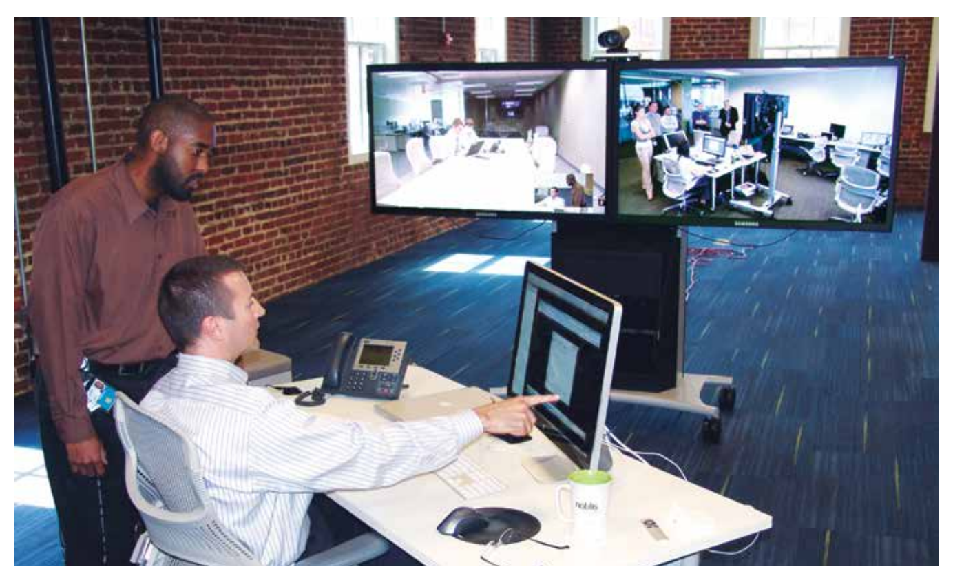
At the Noblis Center for Applied High Performance Computing, Danville, Virginia's fiber network enables always-on videoconferencing.

The large franchise cable companies have also experimented with fiber to the home, especially in new communities. Their pace quickened in 2015. As the demand for gigabit services grows, they have begun to build FTTH on a larger scale. However, that doesn't tell the whole