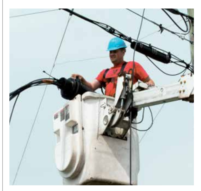
Danville, Virginia's use of its own utility poles for the nDanville network saved the city time and money.

Because both direct service delivery and open access have advantages, some communities are experimenting with different ways of combining the two models. \diamondsuit