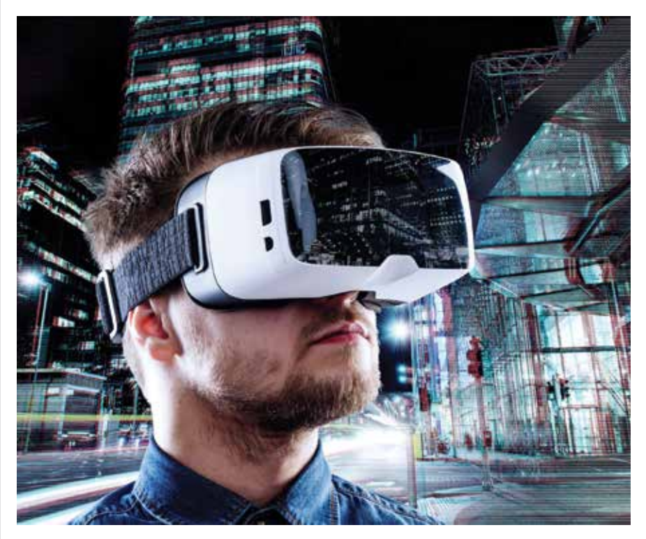
Virtual reality will create massive new bandwidth demand.

Families stay in touch via social media and video calls – Facebook, Skype and Twitter have become household words. Businesses use video communication whose quality is good enough to bring the illusion of "being there" to teleconferencing. It's called telepresence. High-definition video communication has even reached the home market; telecommuting workers can send telepresence robots in their offices to sit in for them at meetings while they participate via their home TVs.