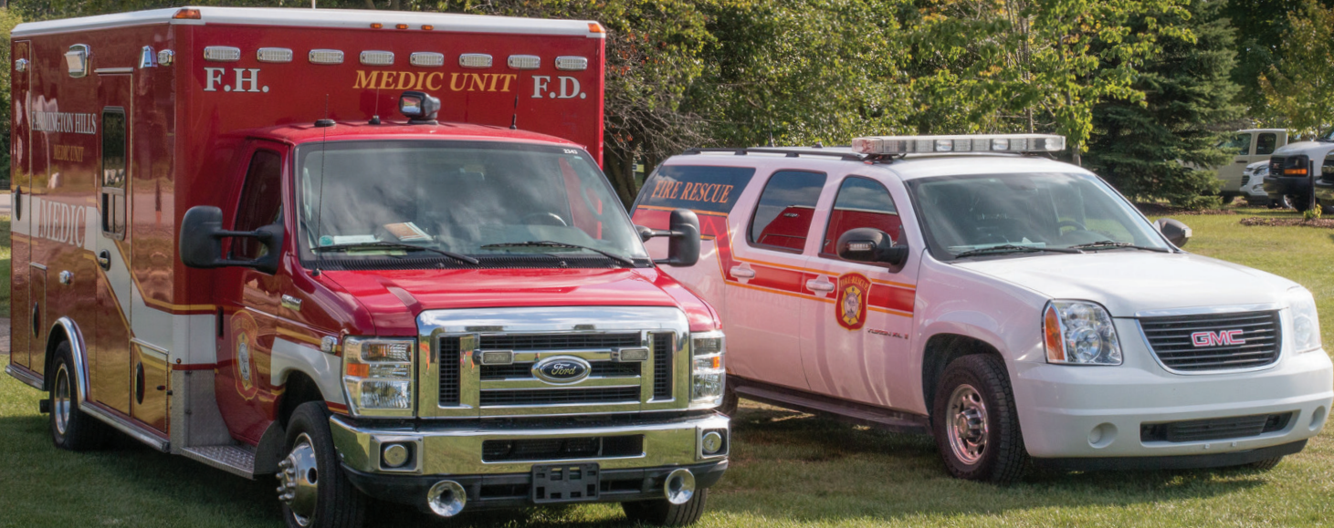
Farmington Hills Medic Unit and Fire Rescue Vehicle