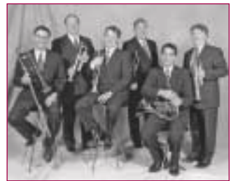
Detroit Chamber Winds

Call 248-473-1857/59 for a brochure or to register.