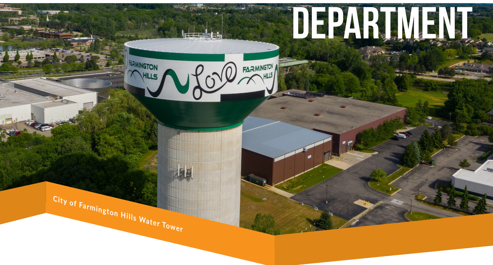
City of Farmington Hills Water Tower