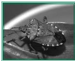
Brown Marmorated Stink Bug

FYI - Think you have Brown Marmorated Stink Bugs? Contact the Oakland County M.S.U. Extension Office at 248-858-0880 or go to the Michigan State Agriculture Department web site at www.Michigan.gov/mda or to www.northeastipm.org for more information.