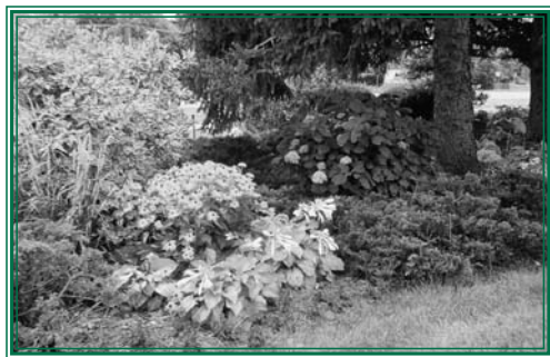
The Beautification Commission presented the 2010 Beautification Commissioners' Award to the North Farmington Garden Club for the O.E. Dunkel Middle School Circle Garden.

FYI – Judging takes place July-August, so prepare your landscapes for a good showing!