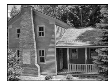
The Mark Arnold House circa 1837

The Historic District Commission works to safeguard the heritage of Farmington Hills by preserving districts in the city that reflect elements of the cultural, social, economic, political or architectural history of the City. Currently, 73 historic districts are designated in Farmington Hills, and the commission works to recognize and designate additional historic districts every year.