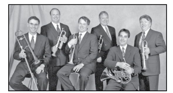
Detroit Chamber Winds Holiday Brass

Wonderful select soloists – hilarious and moving! Saturday, January 23, 7:30 p.m. Farmington Players Barn Theater Tickets - $19 adults, $17 seniors and students